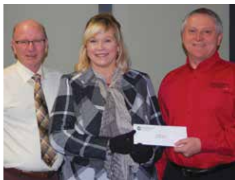
Darke REC gives Operation Round Up grant checks to: (top left) the Gettysburg Fire Department, (top right) Big Brothers Big Sisters, (bottom left) The Center for Neurological Development, and (bottom right) the City of Greenville Parks.